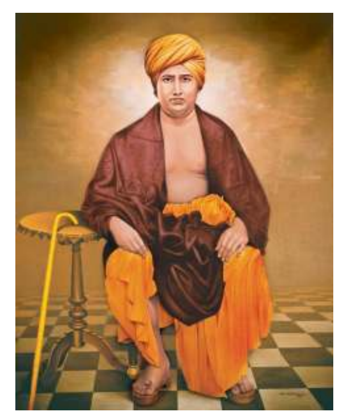
a Math or an Ashram. In his entire life we do not come across a single incidence of his affinity towards a person or a place.

Swami ji had a lot of rich and influential disciples: the landlords, kings, businessmen. They all would have happily donated land and money for an Ashram. But Swami ji never thought of setting up